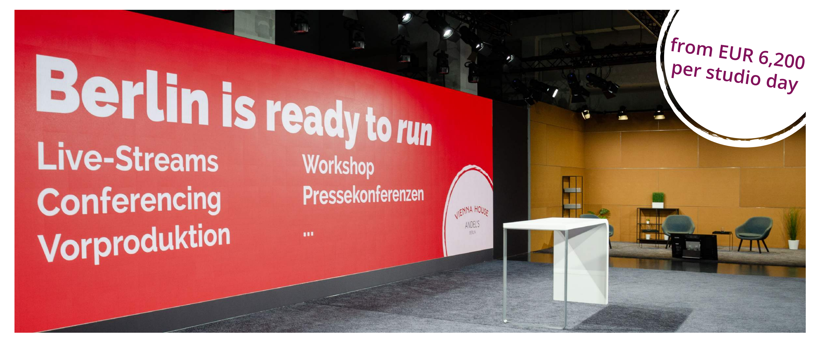
ready to go - with the starter package